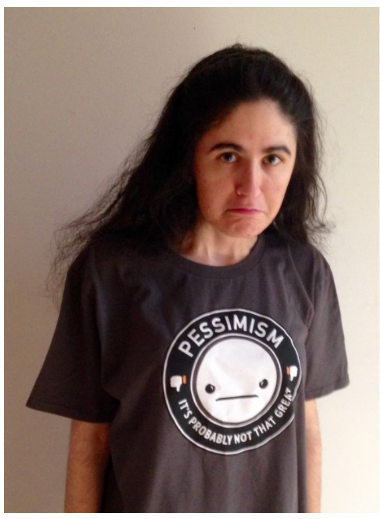
Happy faces are so Pre-November: Really, you think you have a chance to win this shirt?

Submit entries at this website: bit.ly/enter-invite-1203 (all lowercase).