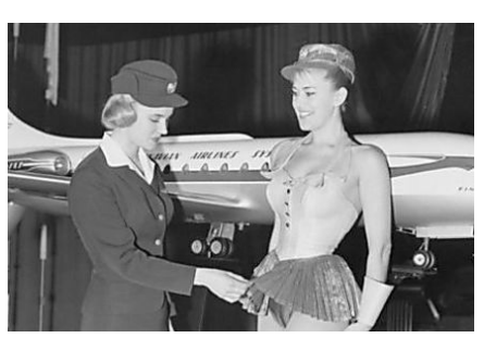
Unnerving Historical Photos That Expose The Past