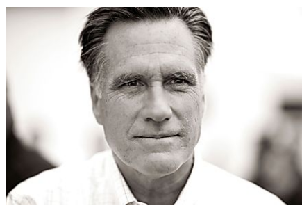
Forget REITs. Invest in Real Estate with Crowdfunding