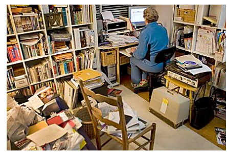
Downsizing? Ditch These 12 Items AARP